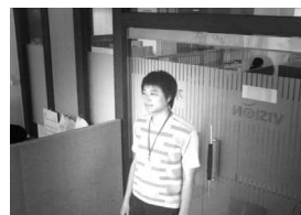
Intelligent IR On