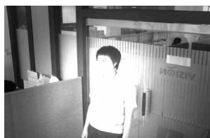
Intelligent IR Off

Improved chroma processing accuracy provides high color reproduction. You'll get more accurate, vibrant colors.